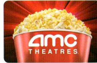
$200 AMC GIFT CARD