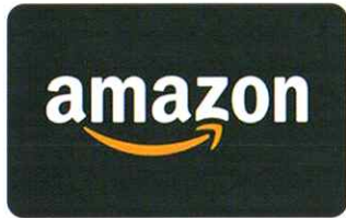
$200 AMAZON GIFT CARD