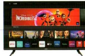
40" SMARTCAST TV