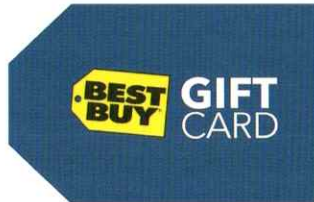
$200 BEST BUY GIFT CARD